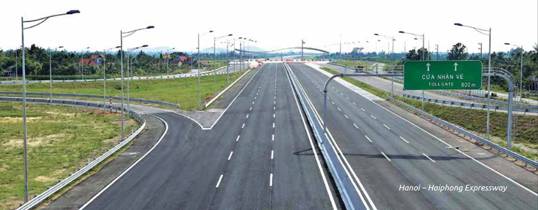
Hanoi - Haiphong Expressway